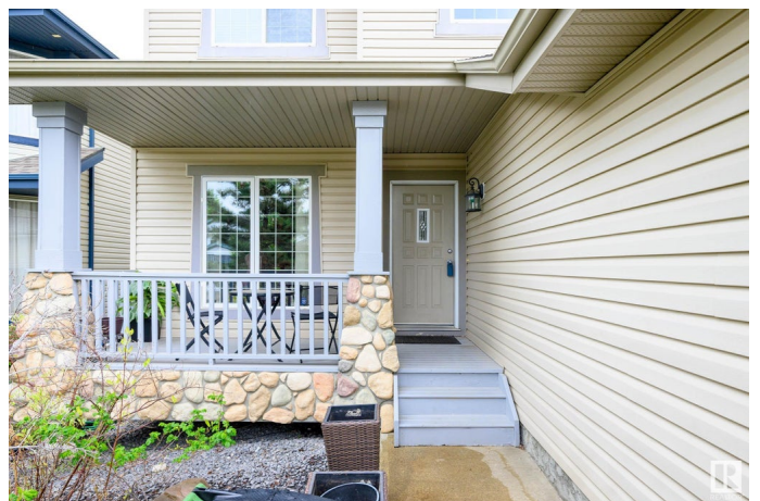
166 Hayward Crescent NW, Edmonton, AB