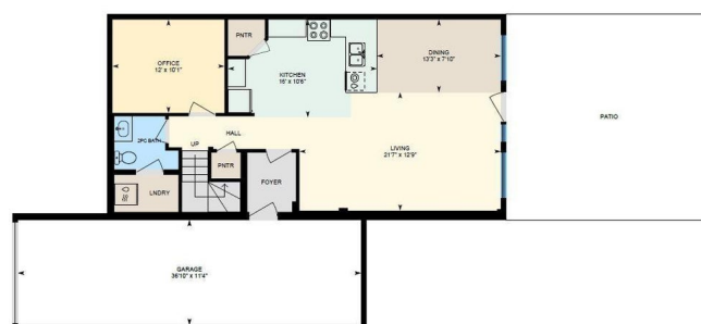
Main Floor: Interior Area 856.69 sq ft Excluded Area 415.67 sq ft